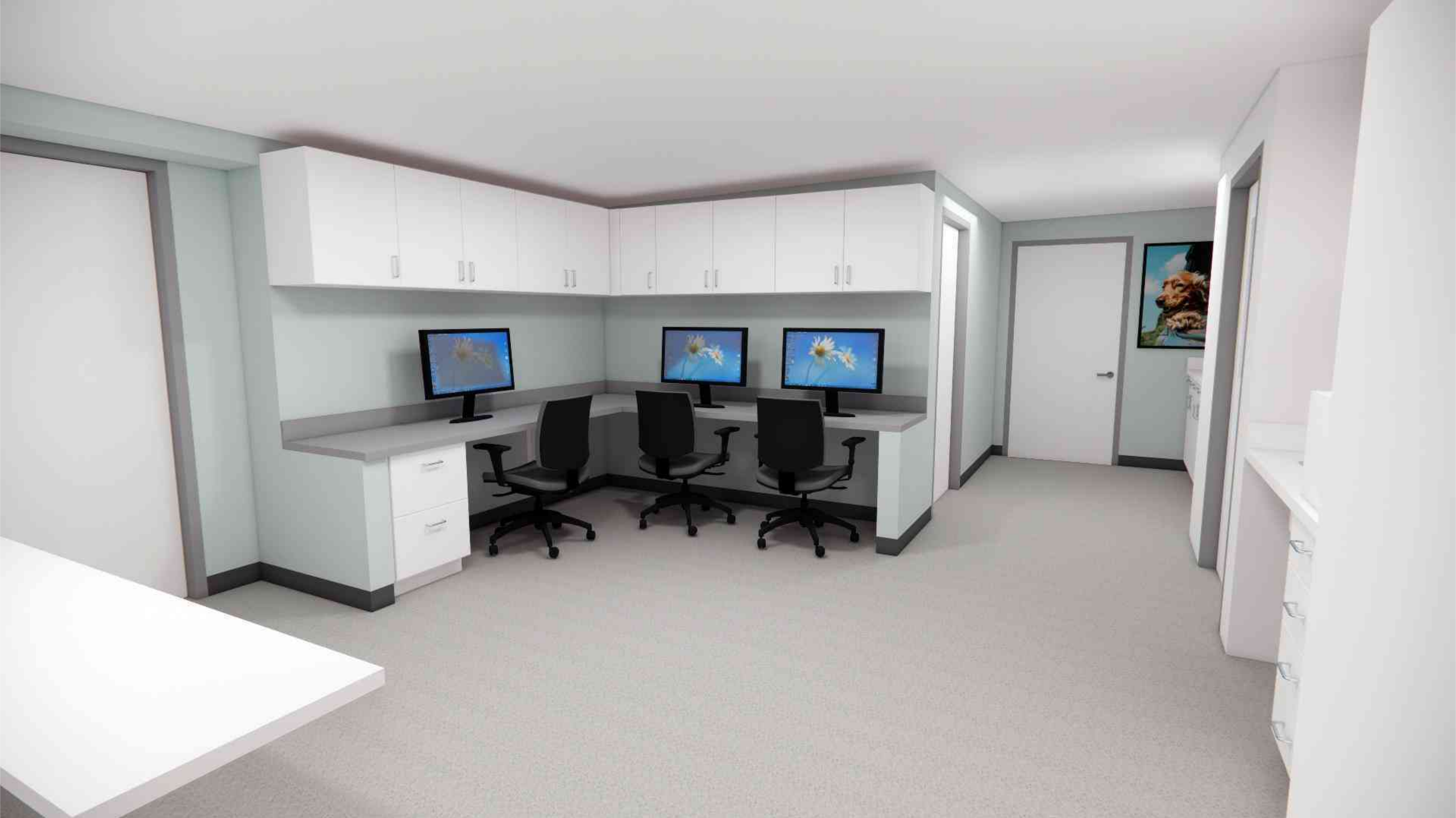
Staff Work Area